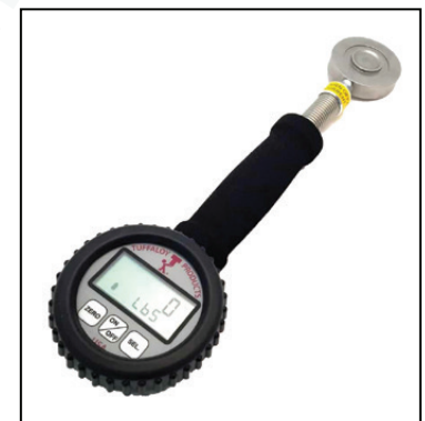
Tuffaloy Digital Force Gauge