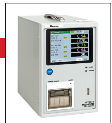
Amada Weld Tech MM-400B