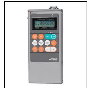
Amada Weld Tech MM-315B